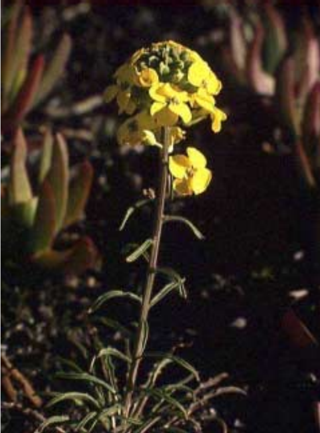
Coast Wallflower – Federal Species of Concern