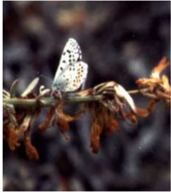
Smith's Blue Butterfly – Federally Endangered