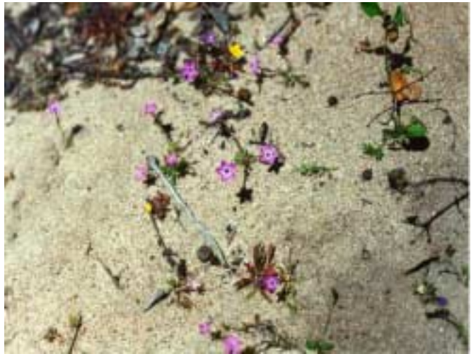
Sand Gilia – Federally Endangered and State Threatened