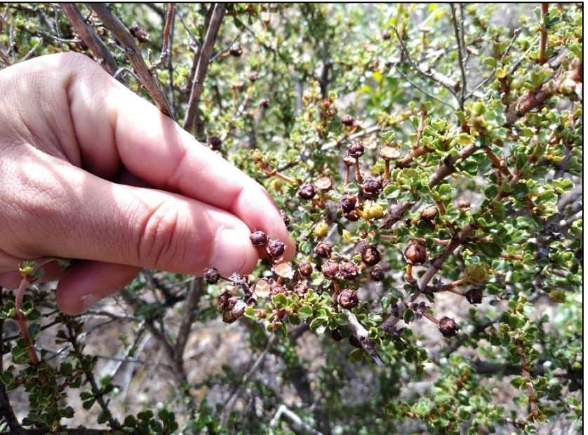
Figures 1 and 2: Collection of Monterey ceanothus.